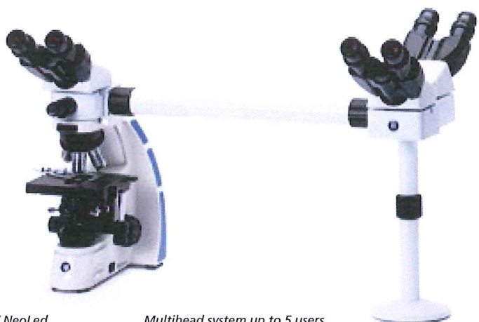
Multihead system up to 5 users with integrated laser pointer

Advanced microscopes for Life and Material Sciences