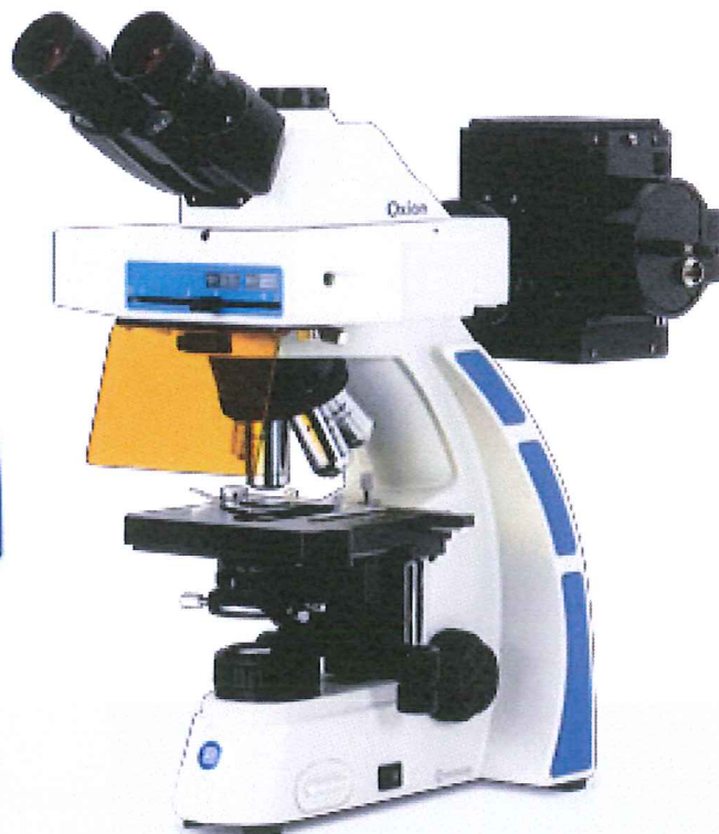
Mercury-vapor fluorescence Oxion