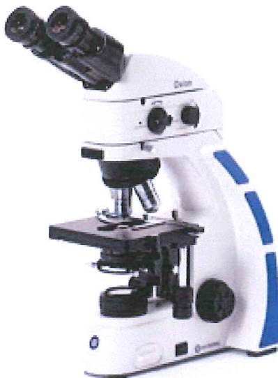
FluoLed fluorescence Oxion

Multihead models with 2, 3 or 5 heads with laser pointer allow simultaneous observation of specimens