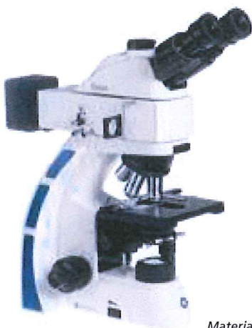
Material Science Oxion with 3 W NeoLed diasopic and episcopic illumination

The plan or plan semi-apochromatic Fluarex objectives together with 22 mm eyepieces and high performance fluorescence filters provide the necessary resolution and field of view to produce excellent contrasted images