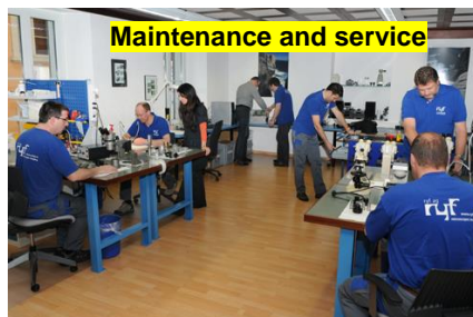
Maintenance and service