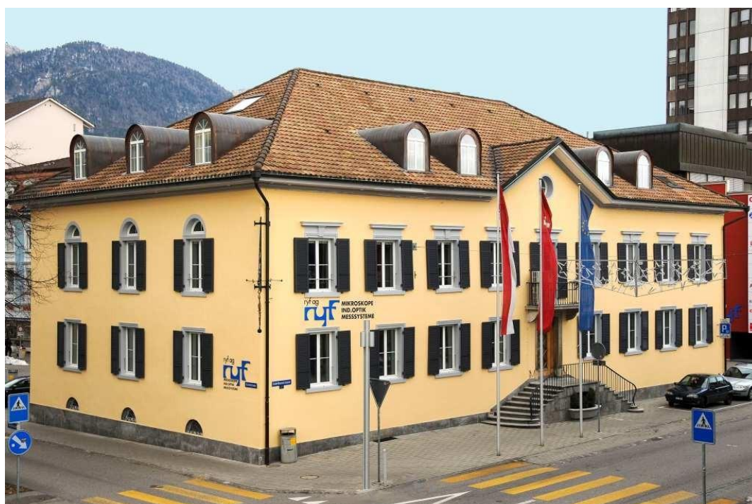
The fully renovated historical "Löwen Haus" in the heart of Grenchen becomes the new company headquarters for Ryf AG in 2003.