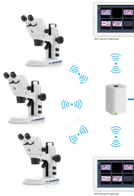
Stemi 305 cam: „Add to existing WLAN“ Mode