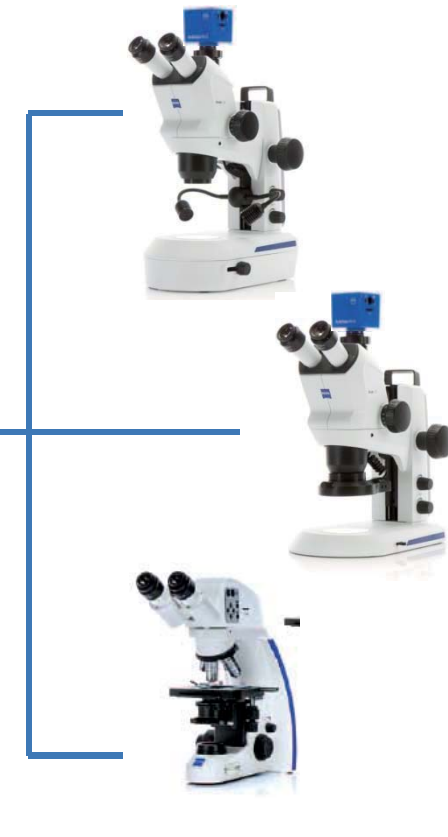
Stemi 508 doc + ERc 5s + External WLAN router