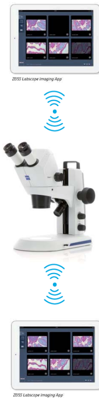
Stemi 305 cam: „WLAN access point“ Mode